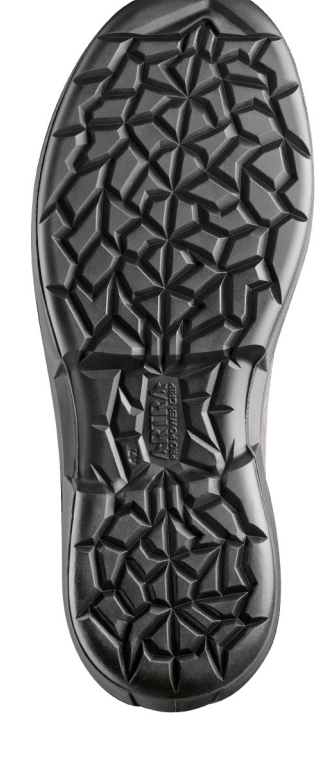
EXCEPTIONAL LIGHTNESS HIGH BREATHABILITY ENERGY SAVING