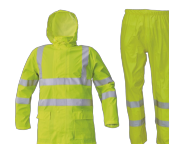
79 HV YELLOW