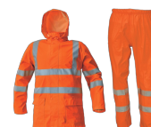
96 HV ORANGE